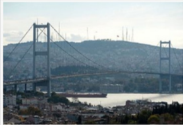
Turkey's strategic position between Europe, Asia and Africa has made it attractive to companies, according to the country's development minister

Speaking at the submit organized by BKR International, a major association of independent accounting and business advisers, Yılmaz said, "The custom union with the EU came into effect in 1996 and Turkey's trade volume with the EU has since reached a remarkable level. Thanks to the advantages of the Custom Union, Turkey has become an attraction center of companies from Asian origin."